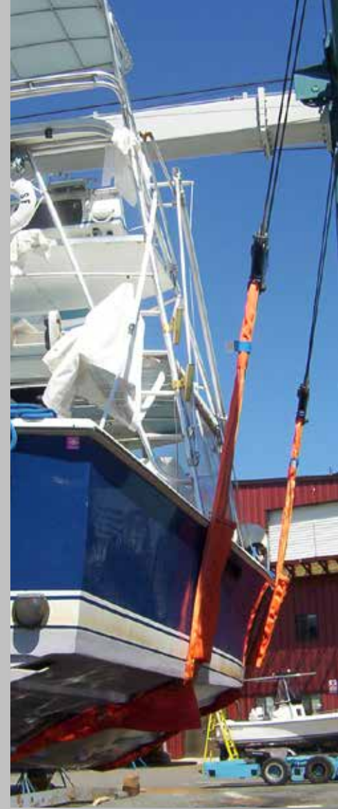
Boat Lifting Belt Slings