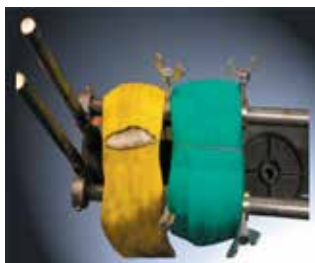
Comparison Round Sling Profix and Round Sling Duplix Inox: after 300 intervals