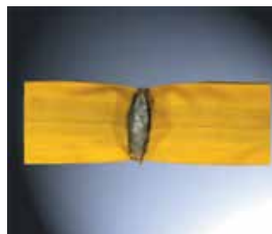
Round Sling Solution: after 400 intervals