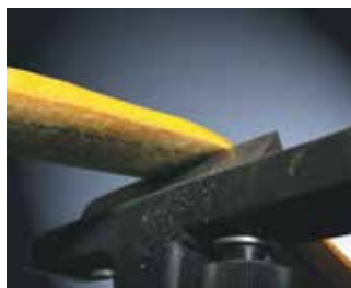
Abrasion test: Round Sling Profix